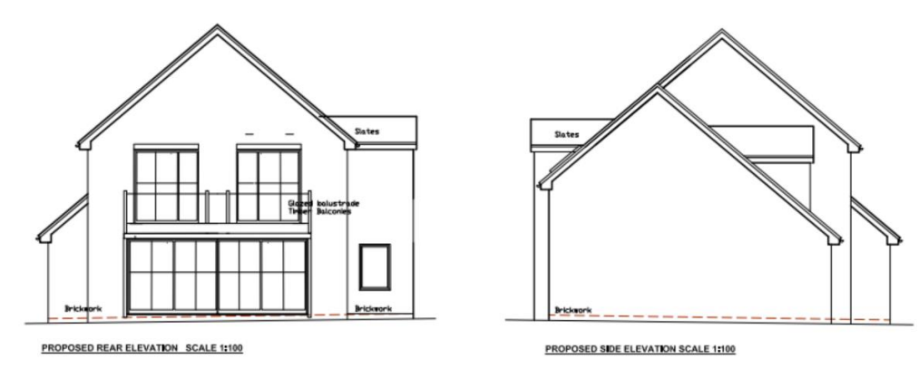
Side (west) elevation (labelled rear) and site (east) elevation