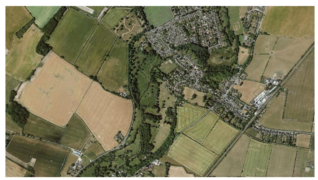
Site in context of wider area (indicated by small black dot)

The site is within open countryside, defined as a Special Landscape Area under saved Policy C6 of the Salisbury District Local Plan and continues to form part of the development plan. Whilst there are two existing semi-detached dwellings at Mount Pleasant, the development of a detached dwelling to the north of the existing dwellings in this location would not visually relate to the existing built form either on site or within the context of the settlement. Although sited on a paddock which is adjacent to a pair of existing houses, the proposal would represent sporadic, isolated development which would constitute an inappropriate encroachment of development in an open landscape setting. Changes to the design, materials or scale of the proposed dwelling or its landscaping would not adequately mitigate against the landscape impact arising from siting a new, independent residential dwelling in this location.