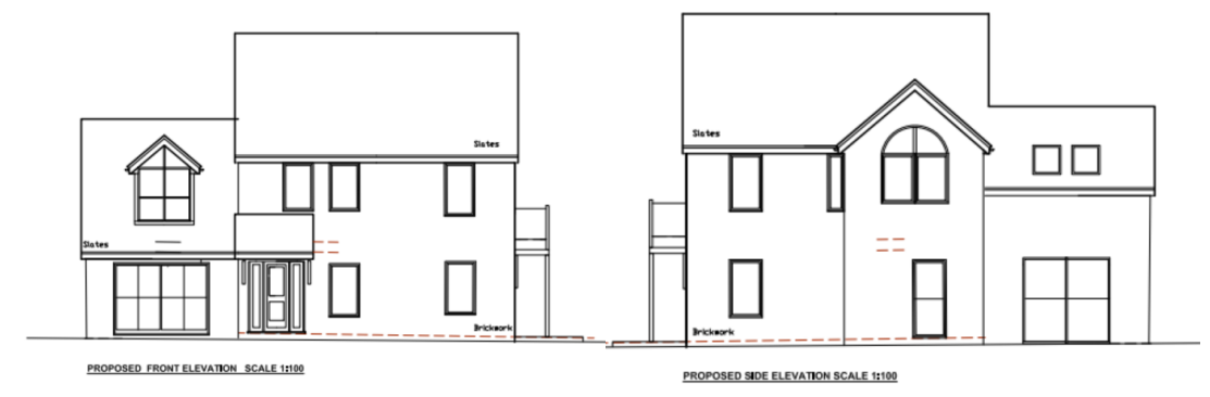
Proposed front (north) elevation and rear (south) elevation (labelled 'side')

roof set below the main ridge line and a small gable extending feature to the rear, as shown in the elevations below. The construction is specified as brick with a grey slate roof.